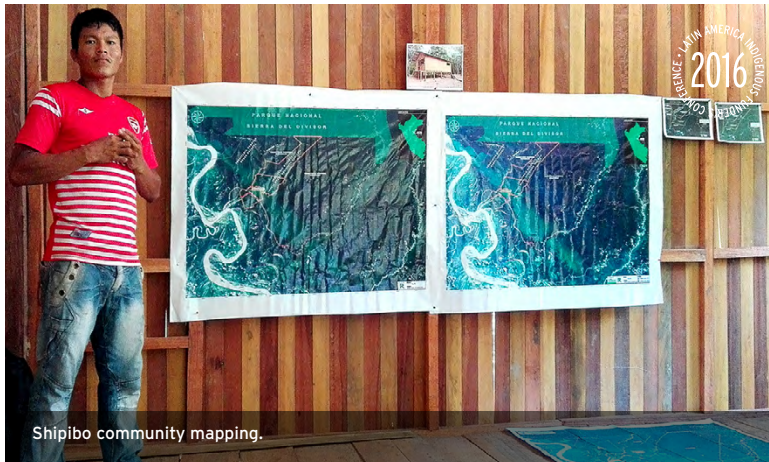
Shipibo community mapping.

In Santa Clara de Uchunya, the visitors were introduced to the community's struggle against a multinational palm oil conglomerate, the Melka family.