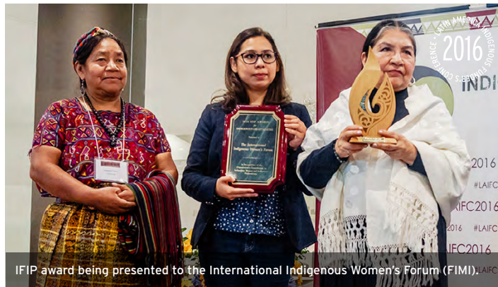
IFIP award being presented to the International Indigenous Women's Forum (FIMI)

Suggestions included: Train Indigenous women on such issues as land rights and business strategy; support women's research in their communities; provide materials in their languages, and promote solidarity among Indigenous women at all levels, from the grassroots to international.