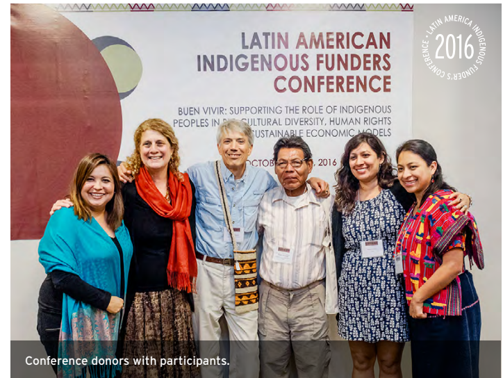
Conference donors with participants.