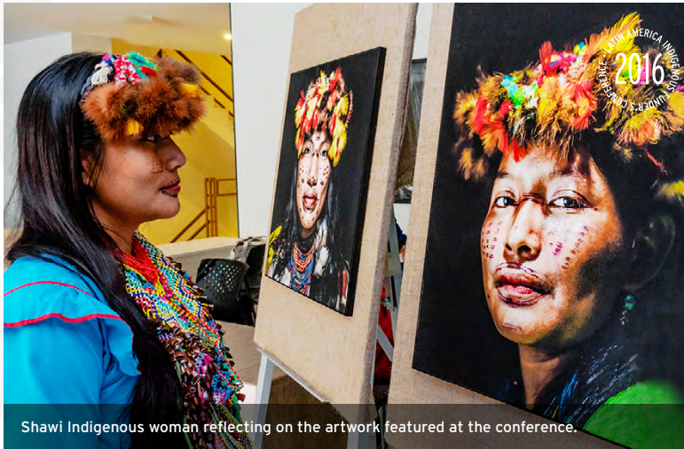
Shawi Indigenous woman reflecting on the artwork featured at the conference.

Each day participants (a group consisting of donors, Indigenous leaders, and environmentalists) learned about the decades-long struggles of these communities to protect their land from such invasions as illegal loggers and palm oil industries. In each community, the group was warmly welcomed by Shipibo families with traditional songs.