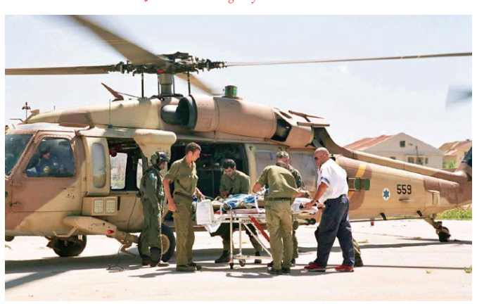
Israeli Defense Forces soldiers treated at Rabin's Emergency and Trauma Center