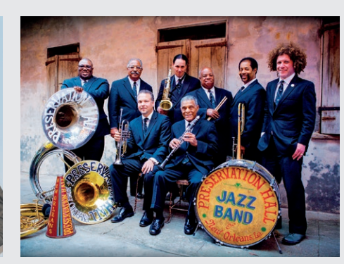
Preservation Hall Jazz Band

ידיעות אחרונות Beilinson, first heart transplant in Israel 1968