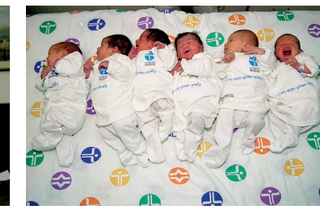
IN VITRO FERTILIZATION

The Helen Schneider Hospital is one of the few places in the world using an advanced In Vitro fertilization technique which involves taking ovarian slices with immature eggs and freezing them for use at a later date. This is revolutionary for cancer survivors whose treatments have depleted or damaged their eggs.