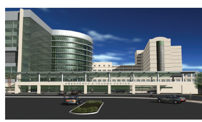
The new Jusidman Emergency and Trauma Center